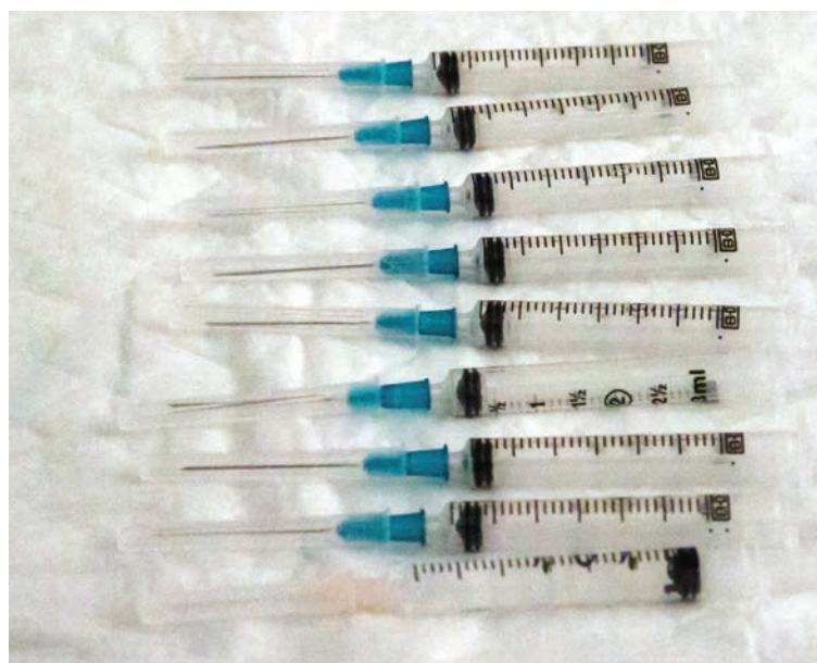
MULTIPLE SYRINGES ARE NEEDED TO PERFORM A FINE NEEDLE ASPIRATION.

mean, I’m interested in what happens when you stop therapy, right? And if we quote-unquote, cure people and put people in remission . We’re gonna measure a million things that we think will control the reservoir in the absence of ART [HIV drugs], and the only way to figure that out is to stop ART. So it’s possible that we will achieve a remission, without affecting the size of the reservoir at