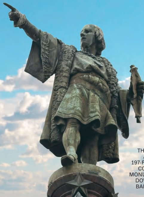
THE STATUE ATOP THE 197-FOOT TALL COLUMBUS MONUMENT IN DOWNTOWN BARCELONA.

Experts on hepatitis C and other liver diseases from all around the world gathered in Barcelona April 13-17, 2016 for the European Association for the Study of the Liver's International Liver Congress (EASL 2016). There were a number of reports related to hepatitis C epidemiology, prevention, and treatment. The following is a selection of relevant presentations.