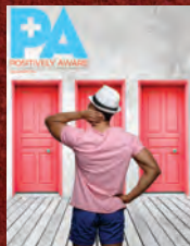
THE COVER 'YOU'VE GOT OPTIONS.'

You'll want to download this PDF and take it with you to your healthcare provider.